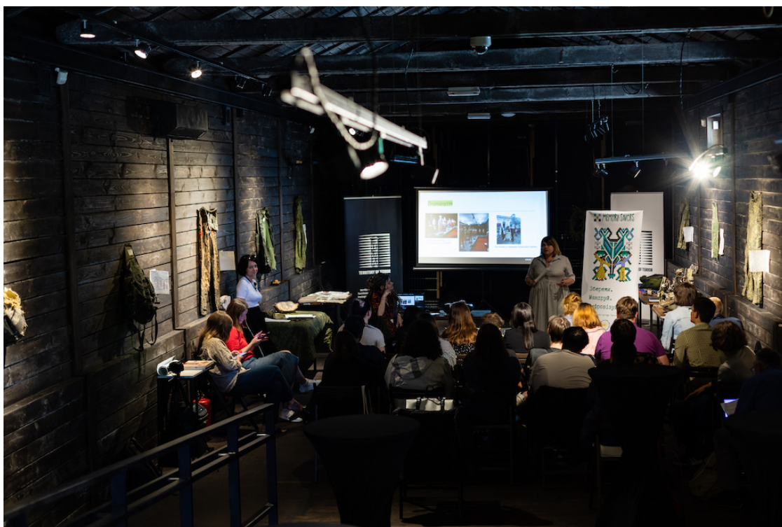
Students participating in a Memory Savers coordination meeting in Lviv, Ukraine during August 2023.

As of August 1, 2023, SUCHO has fulfilled 95 digitization equipment requests from 71 Ukrainian cultural institutions . Institutions include museums (37), libraries (21), archives (4), historical sites (4), research centers (2), music academies (2), and city government (1).